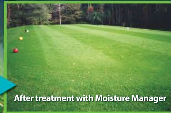
After treatment with Moisture Manager