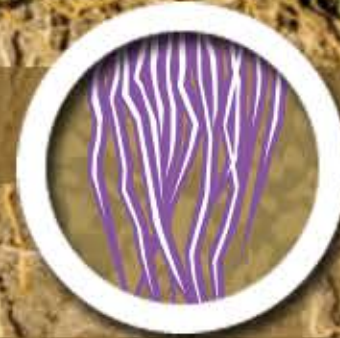
Moisture Manager film can persist through multiple irrigation cycles lasting up to three full months