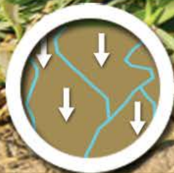
Dry soil becomes hydrophobic channeling water away rather than absorbing it into the soil