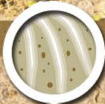
Roots stop growing as they hit dry soil and delicate root hairs begin to shrink, desiccate and die