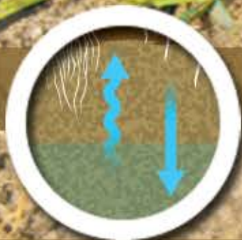
Gravity and evaporation are constantly at work against you removing moisture from the soil