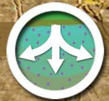
Treated soils readily accept new moisture making it available to roots