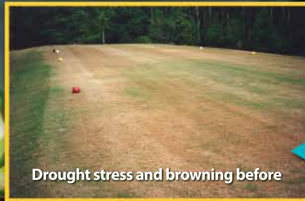
Drought stress and browning before

Soil treated with Moisture Manager uses newly available water more effectively than soil in a more hydrophobic state. Instead of channeling it away, the soil permits distribution of available water, suspending it in the soil matrix and making it available to your plants' roots.