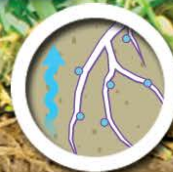
Moisture Manager constantly captures and retains water vapor forming microscopic reservoirs